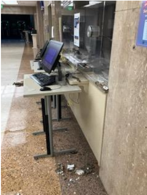
Damage to the Public Terminals.