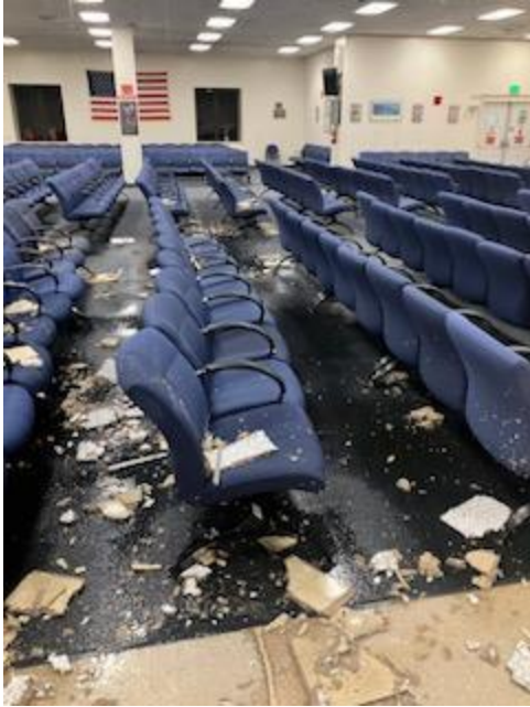
Damage to the Jury Room.