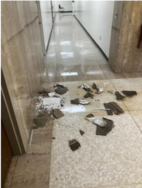
Damage to the Public Areas.